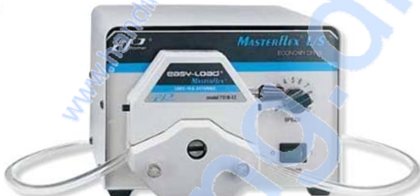
L/S variable-speed console drive 07554-90 with L/S Easy-Load pump head 07518-12